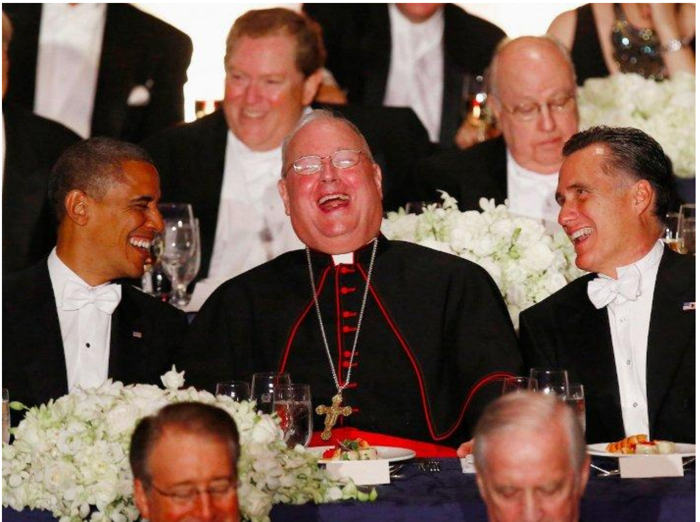
U.S. President Barack Obama (L) and Republican presidential candidate Mitt Romney share a laugh with Cardinal Timothy Dolan (C) at the 67th Annual Alfred E. Smith Memorial Foundation dinner in New York, October 18, 2012.

Four years ago, President Barack Obama and Mitt Romney set aside their differences to trade (mostly) warm jokes. Romney, scanning the well-heeled crowd in the gilded Waldorf-Astoria ballroom, joked that the event's white-tie attire finally gave him a chance to publicly don what "Ann and I wear around the house." Obama, meanwhile, used his speech that year to look ahead to an upcoming debate on foreign policy, previewing his argument by saying "Spoiler alert: we got Bin Laden."