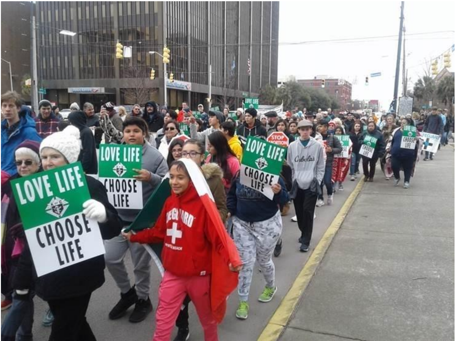
SC Citizens for Life March to SC State House Gervais Street, Columbia, SC January 12, 2019

Many Roman Catholics participate in the SC Citizens for Life March and Rally. Here on Gervais Street enroute to the SC State House, the March led by Fourth Degree Knights of Columbus color guard included the yellow and white Vatican flag , and rows of additional Fourth Degree Knights of Columbus , loyal to the Vatican's Papacy in Rome. About a dozen or so Knights of Columbus "LOVE LIFE - CHOOSE LIFE" signs are visible in this part of the crowd of marchers, with the Knights of Columbus emblem of the order in the center.