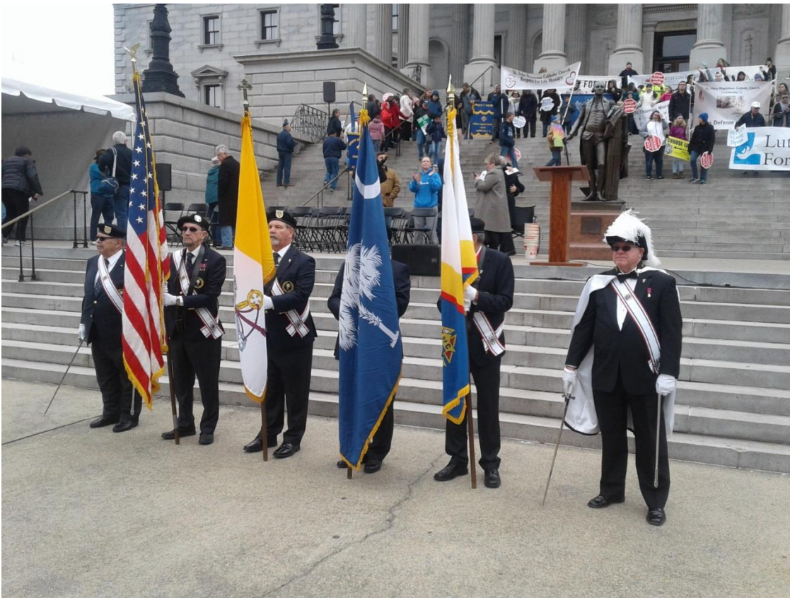
Prominent position taken in front of March and Rally participants at completion of the March, preceding SC Citizens for Life Rally SC State House, Columbia, SC January 12, 2019

Fourth Degree Knights of Columbus color guard at SCCL Rally - yellow and white Vatican flag is second flag from the left.