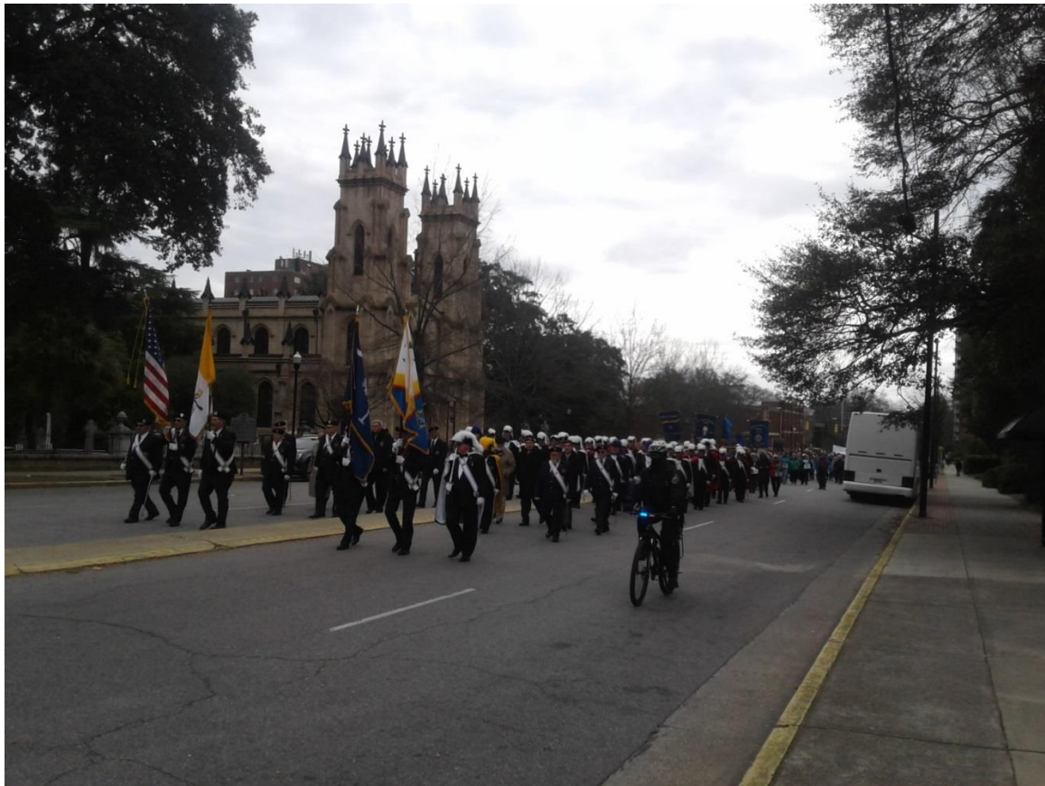
SC Citizens for Life March to SC State House Sumter Street, Columbia, SC January 12, 2019

Fourth Degree Knights of Columbus color guard and rows of additional Fourth Degree Knights of Columbus , loyal to the Vatican's Pope in Rome *** , lead the SC Citizens for Life March on Sumter Street enroute to the SC State House - yellow and white Vatican flag is second flag from the left.