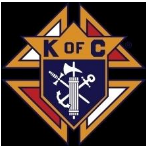
Emblem of the Knights of Columbus