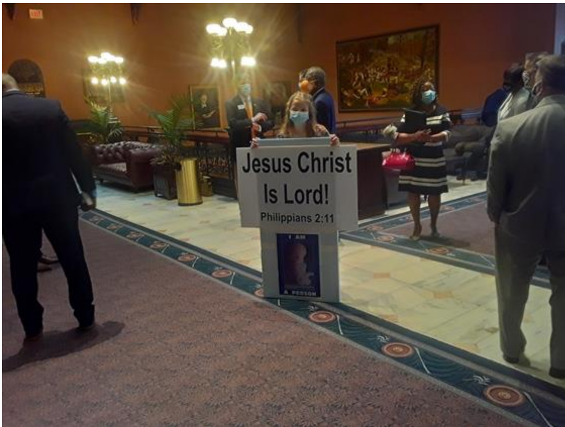
Young lady with "Jesus Christ Is Lord !" and "I Am a Person" signs, Second Floor Lobby, SC State House, Columbia, SC - Tuesday, September 15, 2020 - During Special Session of the South Carolina Legislature

Report on "Republican"-Majority SC Legislature continued funding of Child-Murder and Child-Murderers after Special Session September 15-24, 2020