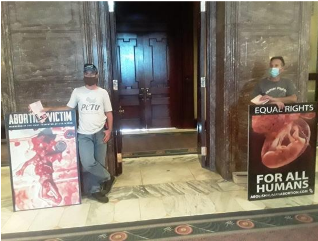
Two Christian men with "Abortion Victim" and "Equal Rights" signs, Second Floor Lobby, SC State House, Columbia, SC - Tuesday, September 22, 2020 - During Special Session of the South Carolina Legislature

What manner of CHAOS might ensue after November 3 ?