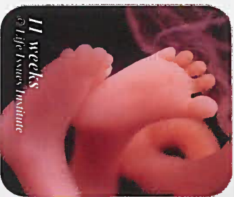
11 weeks