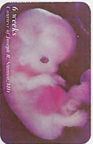
6 weeks

Unborn babies are human beings and can feel pain