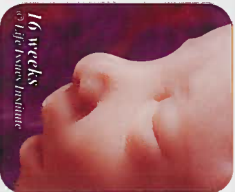
16 weeks

Watch an amazing 4D ultrasound video: www.truthbooth.org/video.asp