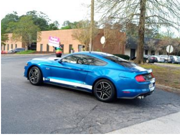
March 28, 2023 – Abortionist Harvey Brown arriving at 2712 Middleburg Drive, Columbia with Planned Parenthood “deathscort” holding sign