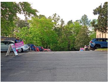
March 31, 2023 – Planned Parenthood child extermination center parking lot with Planned Parenthood “deathscort” with sign