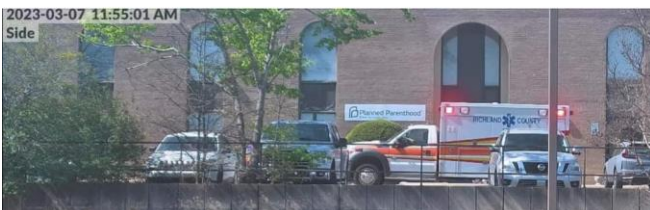
Mar 7, 2023 – AMBULANCE called to Planned Parenthood, 2712 Middleburg Drive, Suite #107, Columbia, SC

Ambulance and police were called to Planned Parenthood today. We are not sure why, but it was an abortion day. We will be requesting the 911 recording to find out. This is the 5th ambulance we've recorded here in just over two years. Pray our legislators will pass a ban to close this place down.