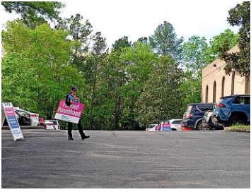
March 28, 2023 – Planned Parenthood child extermination center parking lot with Planned Parenthood “deathscort” holding sign