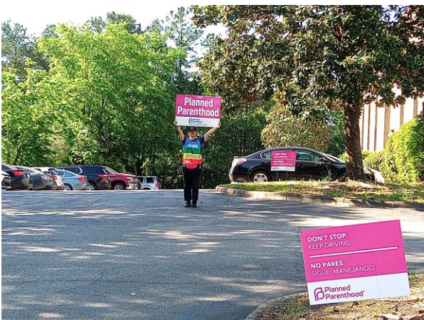
April 21, 2023 – Planned Parenthood child extermination center parking lot with "deathscort" holding sign.