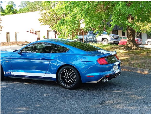
April 21, 2023 – Abortionist Harvey Brown arriving at 2712 Middleburg Drive, Columbia. Planned Parenthood "deathscort" in background.