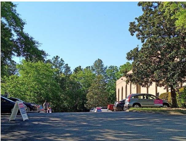
April 11, 2023 – Planned Parenthood child extermination center parking lot with Planned Parenthood “deathscorts”