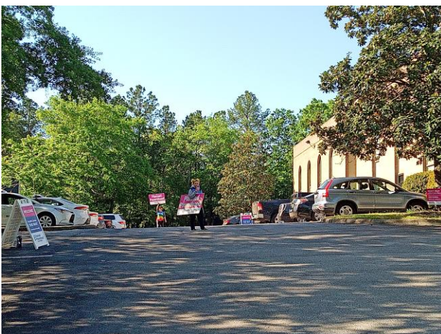
April 18, 2023 – Planned Parenthood child extermination center parking lot and “deathscorts”.