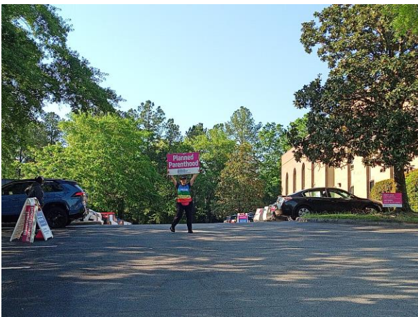
April 15, 2023 – Planned Parenthood child extermination center parking lot with Planned Parenthood “deathscort” holding up sign.