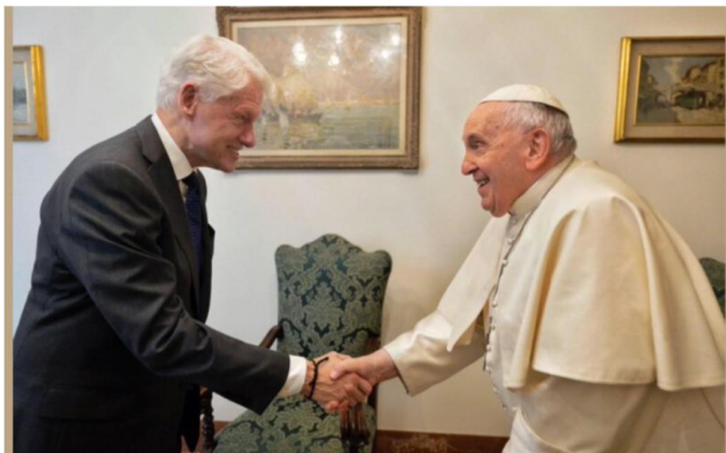
Bill Clinton greets Pope Francis, July 2023.

Pope Francis will kick off the 2023 Clinton Global Initiative two-day conference September 18, by holding a 'special conversation' with former President Clinton.