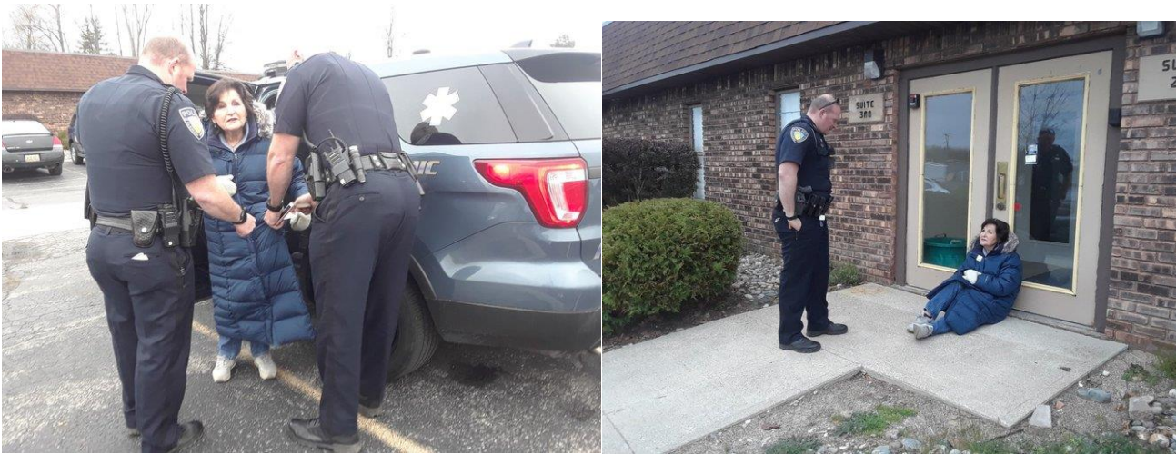
3:02 PM · Oct 6, 2022

The FACE Act was written to equally protect abortion clinics, pro-life pregnancy resource centers, and churches. However, since the Supreme Court’s Dobbs decision , the DOJ has notably charged more pro-life activists under the FACE Act than pro-abortion activists, even though FBI Director Christopher Wray admitted in November 2022 that approximately 70 percent of abortion-related threats of violence in the United States since the Dobbs decision have been against pro-life groups.